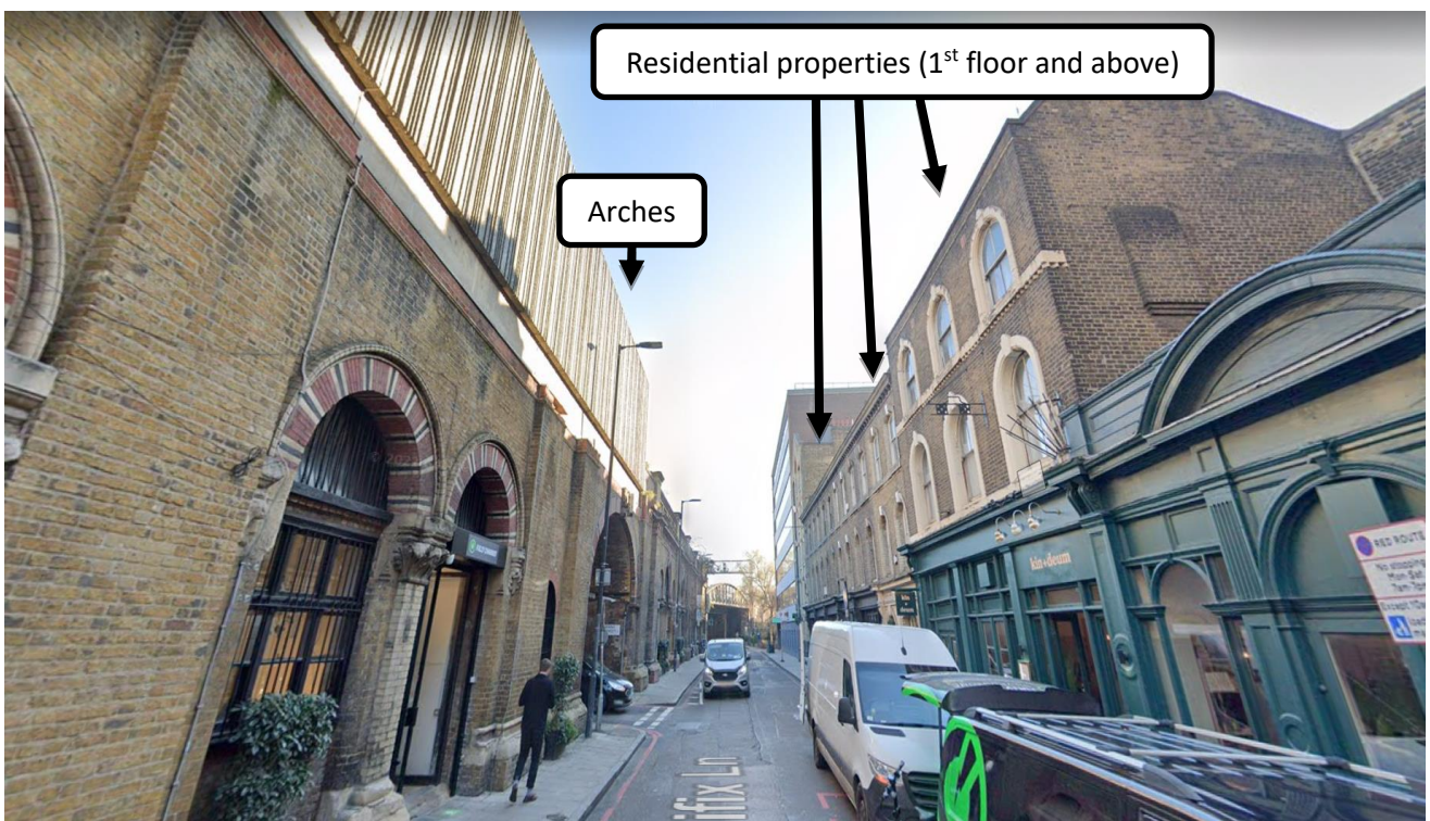
Figure 1: View showing the close proximity of arches on Crucifix Lane to residential properties directly opposite the arches.

During the evening and late at night Crucifix Lane is quiet with low levels of vehicular traffic.